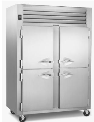
Model RLT232WUT-HHS (shown with optional casters)